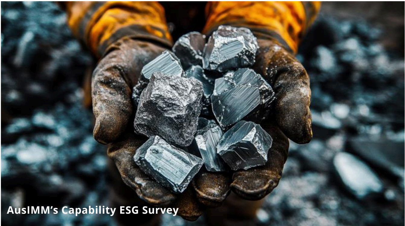
AusIMM's Capability ESG Survey